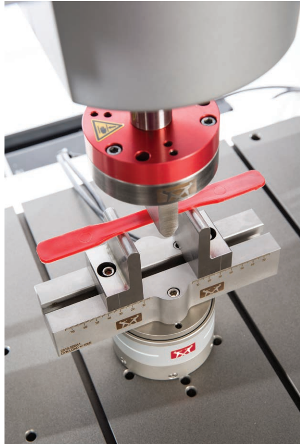
Polyethylene sample under test, showing experimental set-up

Conventional servo-hydraulic test instruments use a linear variable differential transformer (LVDT), a type of inductive absolute encoder, to determine the linear direction of travel and position of the actuator.