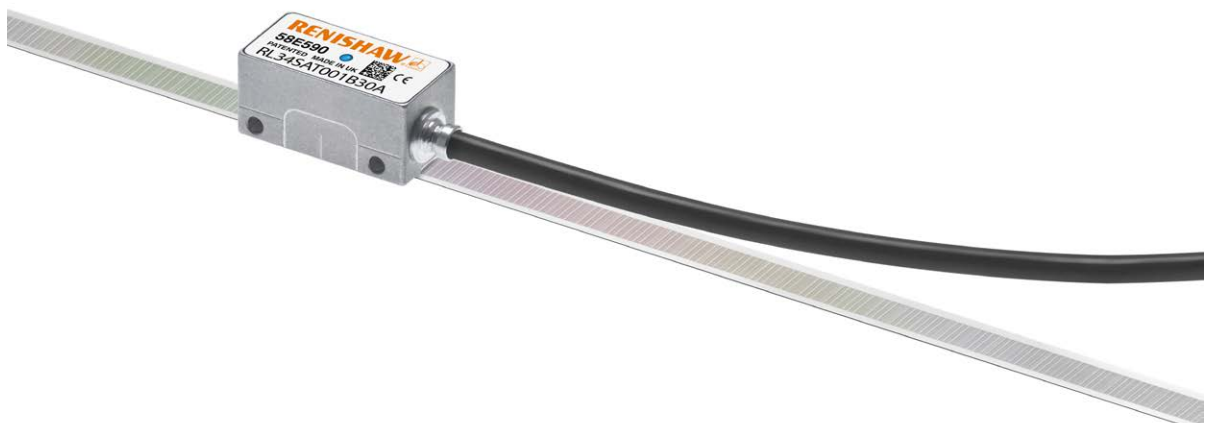
RESOLUTE readhead with RTLA tape scale