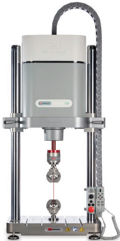
Image of the E3000 linear-torsion test instrument with a sample under test